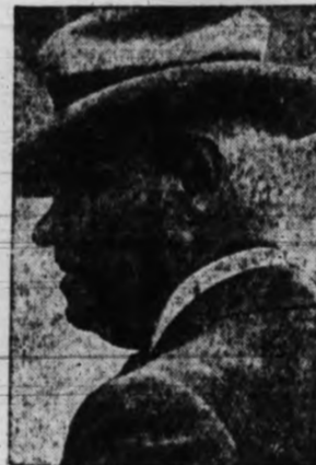
Major-General Goethals fuel distributor of New York state, urged an embargo on anthracite shipments to Canada, but the U. S. Federal authorities couldn't see it that way.